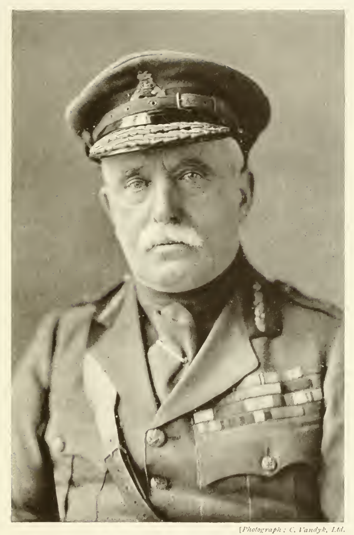
FIELD-MARSHAL VISCOUNT FRENCH.