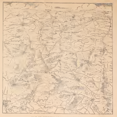
MAP OF COUNTRY FROM MONS TO PARIS