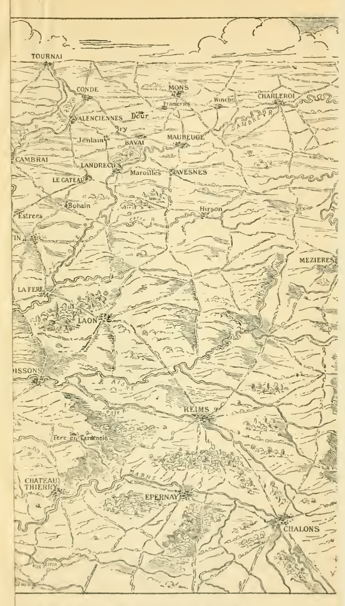
COUNTRY FROM MONS TO PARIS