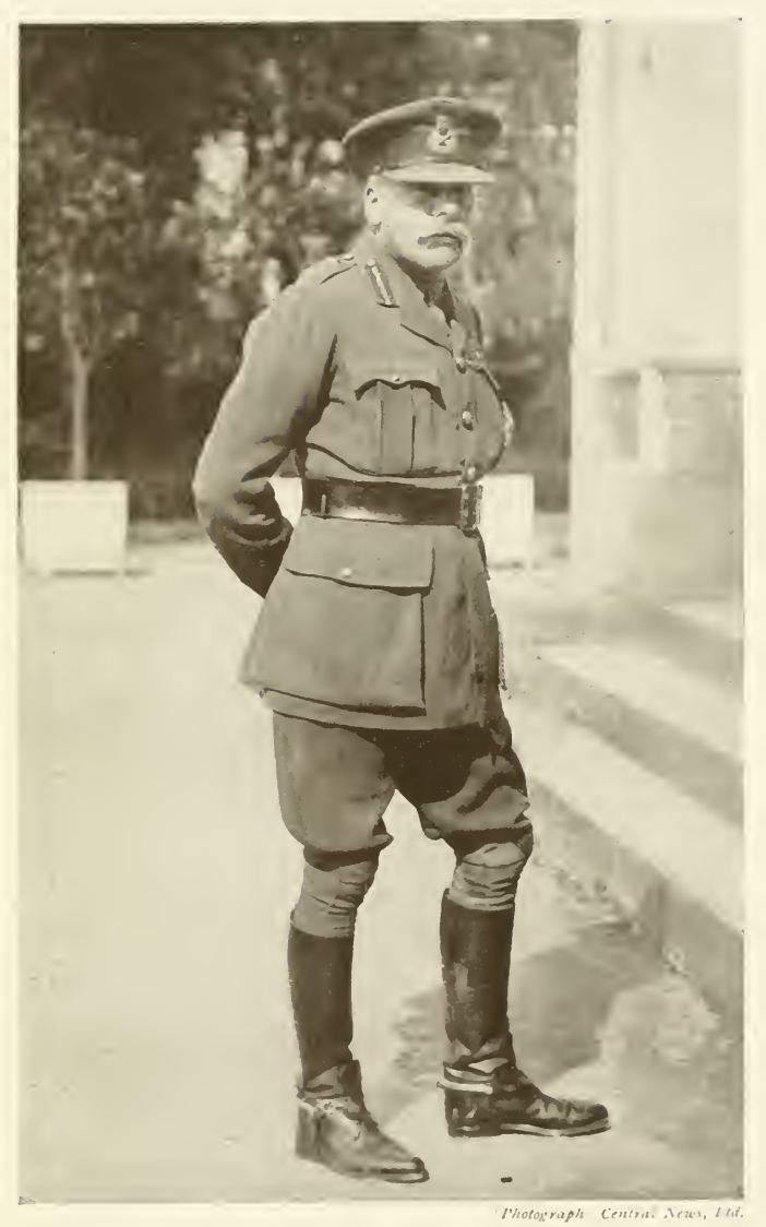
GENERAL SIR DOUGLAS HAIG.